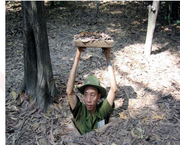
Cu Chi Tunnels draft