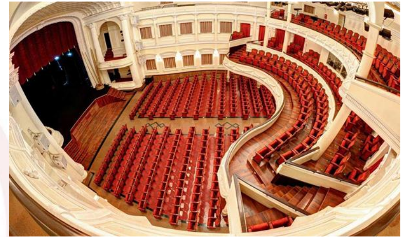
Saigon Opera House

Standing magnificently at the heart of Ho Chi Minh City is the Saigon Opera House, which is also known as the Municipal Theatre. The building stands as one of the impressive sight in Saigon – both night and day. Built in parallel structure, the Opera House is located on the city's center axis, connecting the metro station and roundabout in front of Ben Thanh market. From a distance, the Opera House looks like a beautiful gigantic city gate. The architecture boasts stone-carved ornaments and statues at the entrance, crystal chandeliers, and shiny granite floor at the lobby area – all built with materials imported from France. The oval auditorium with 468 seats offers good view from every seat. It is also echo-free and therefore preserves all the sound inside the theatre.