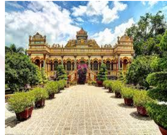
Vin Trang Pagoda