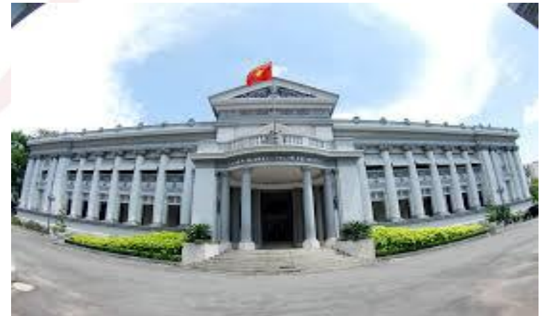
Ho chi Minh City Museum

A grand neoclassical structure built in 1885 and once known as Gia Long Palace (and later the Revolutionary Museum), HCMC's city museum is a singularly beautiful and impressive building, telling the story of the city through archaeological artefacts, ceramics, old city maps and displays on the marriage traditions of its various ethnicities. The struggle for independence is extensively covered, with most of the upper floor devoted to it.