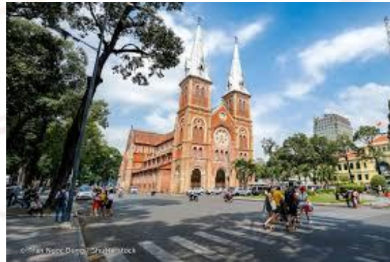
Notre Dame cathedral