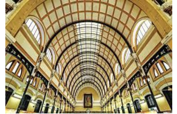
Central Post Office