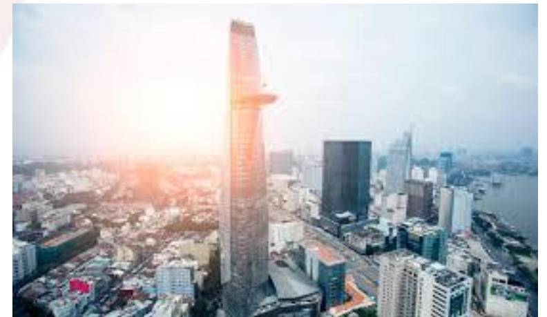
Bitexco Financial Tower – Saigon Skydeck