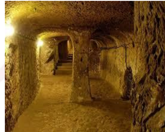
Cu Chi Tunnels