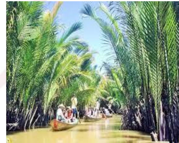
Boating in Vin Trang Delta