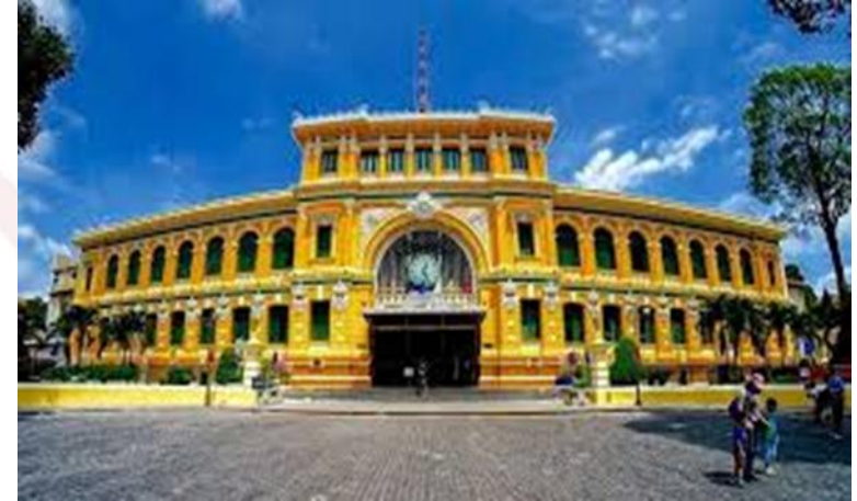
Central Post Office

A grand neoclassical structure built in 1885 and once known as Gia Long Palace (and later the Revolutionary Museum), HCMC's city museum is a singularly beautiful and impressive building, telling the story of the city through archaeological artefacts, ceramics, old city maps and displays on the marriage traditions of its various ethnicities. The struggle for independence is extensively covered, with most of the upper floor devoted to it.