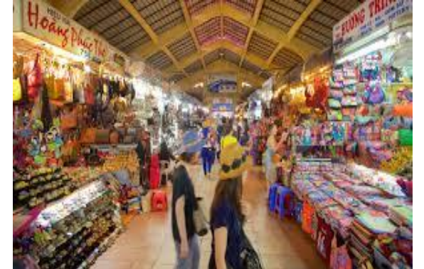
Ben Thanh Market