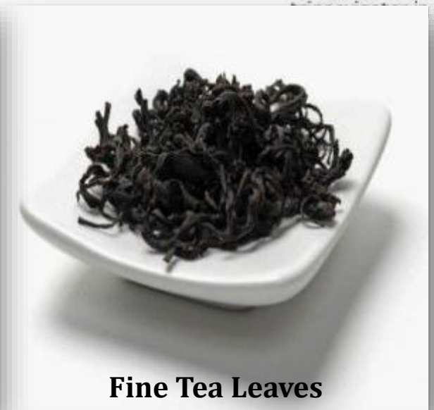
Fine Tea Leaves