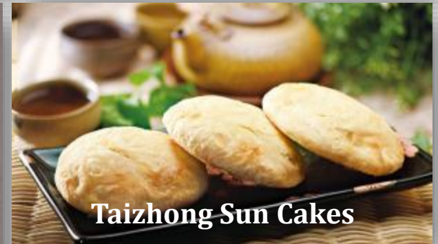
Taizhong Sun Cakes