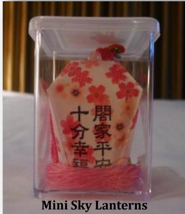
Mini Sky Lanterns