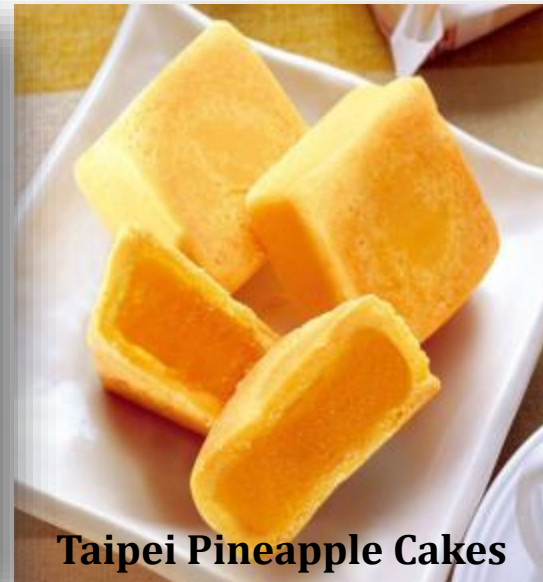
Taipei Pineapple Cakes