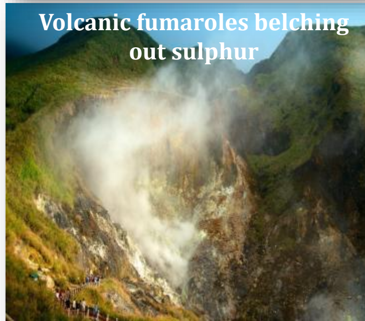
Volcanic fumaroles belching out sulphur