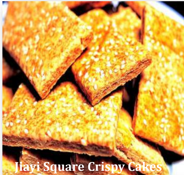
Jiayi Square Crispy Cakes