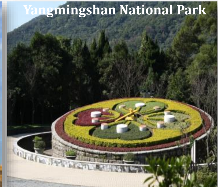
Yangmingshan National Park