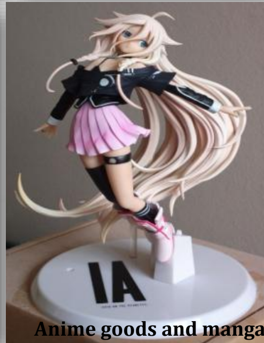
Anime goods and manga