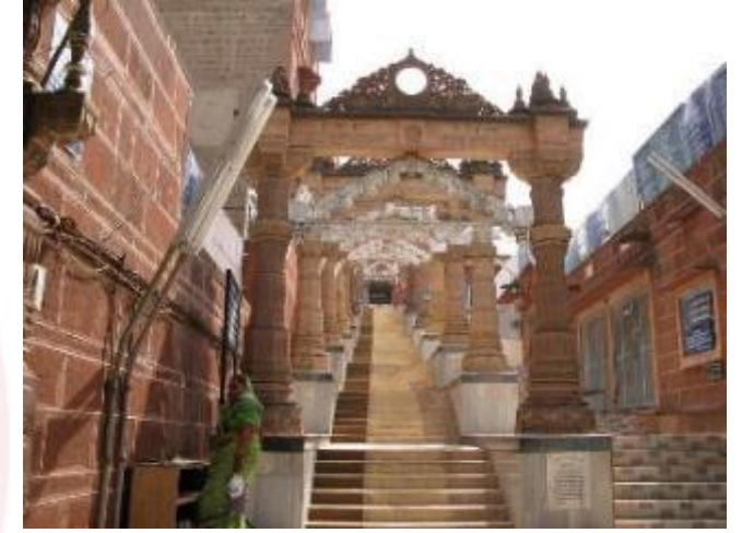
Osian - 65kms