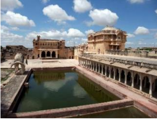
Nagaur Fort- 47.1kms(1 hr)