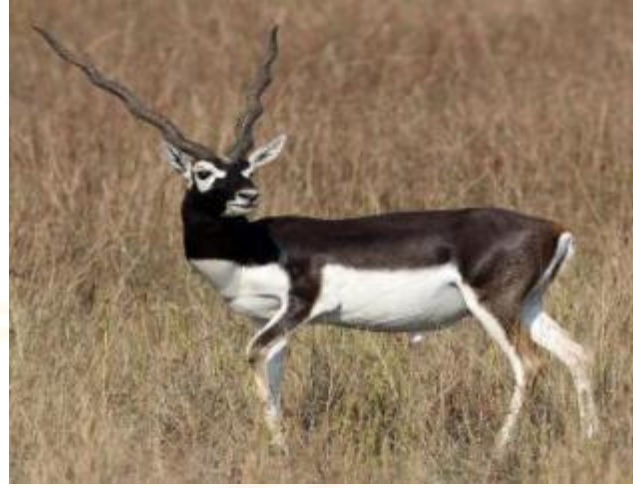
Panchla Black Buck Safari-17kms(20 min)