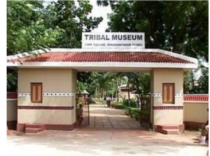
Museum of Arts and Artifacts