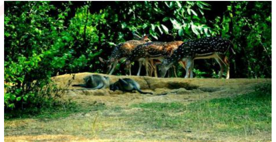
Chandaka Dampara Sanctuary