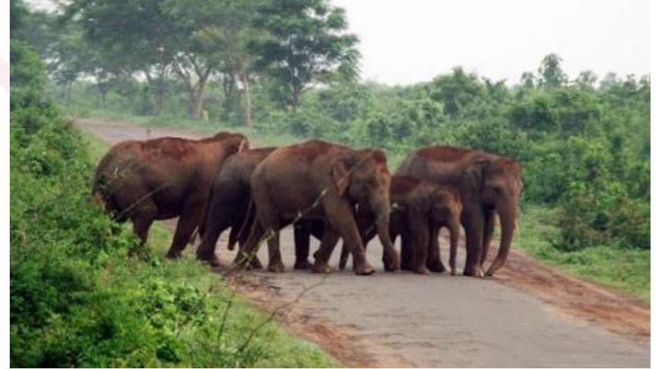
Chandaka Dampara Sanctuary