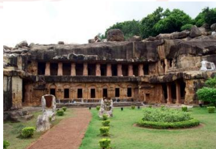
Udaygiri jain caves