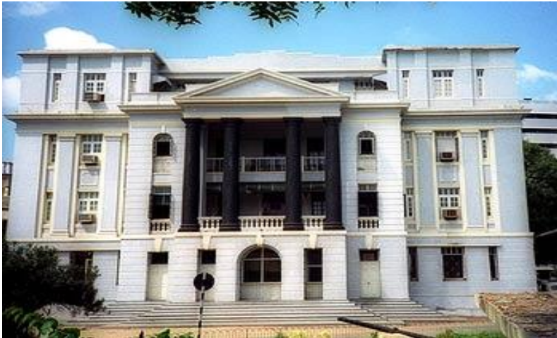
Fort St. George