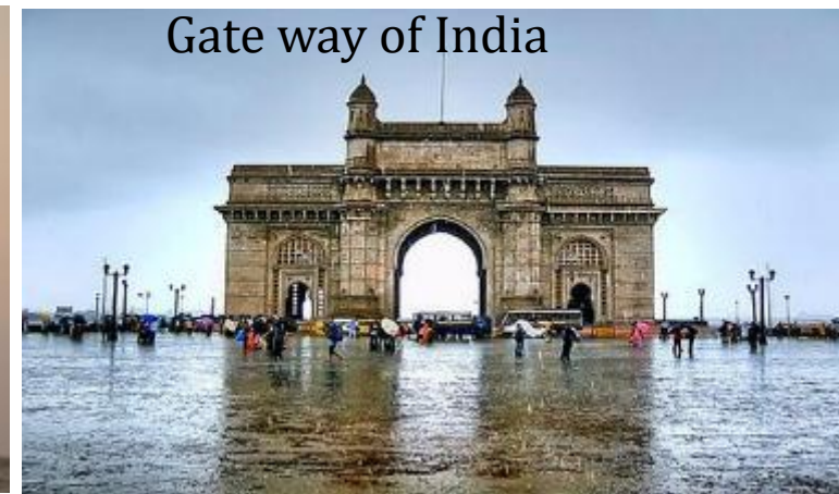
Gate way of India