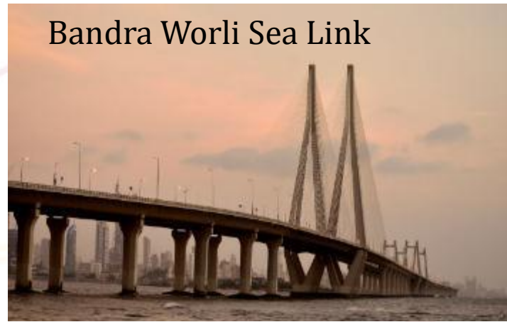
Bandra Worli Sea Link