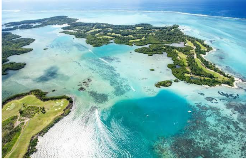
Ile Aux Cerfs Island Excursion