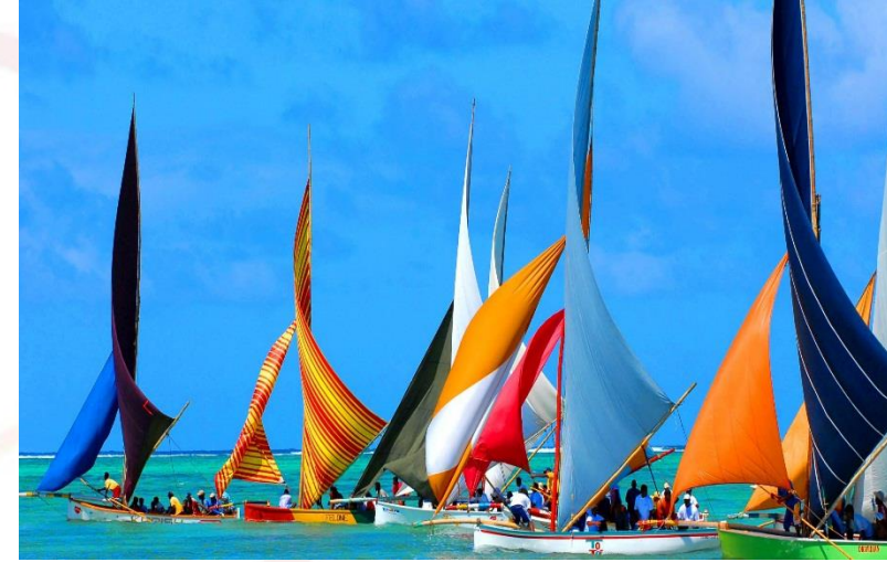
South Coast Tour