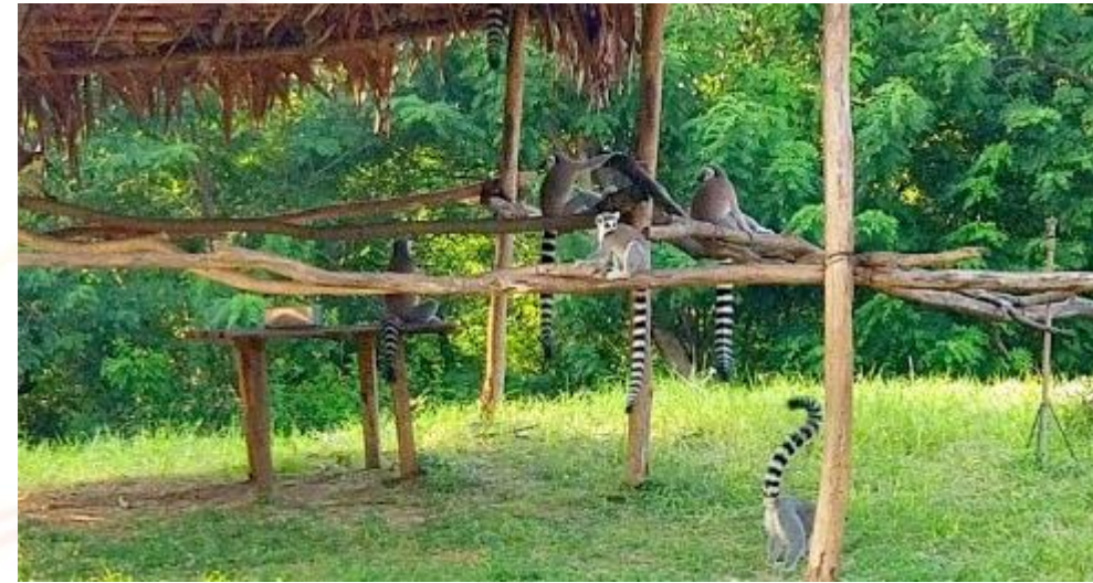
KAMBALAKONDA WILD LIFE SANCTUARY