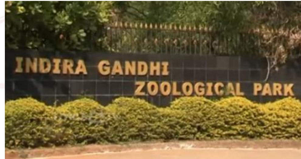
INDIRA GANDHI ZOOLOGICAL PARK