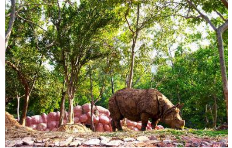
Indira Gandhi Zoological Park