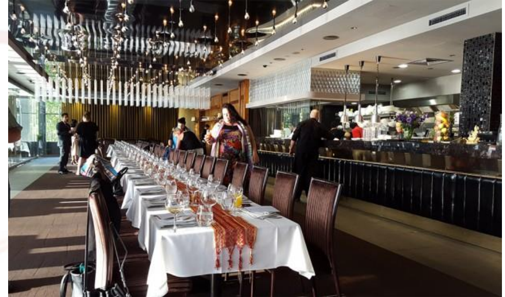
Manjit's Wharf Venue Capacity - 200