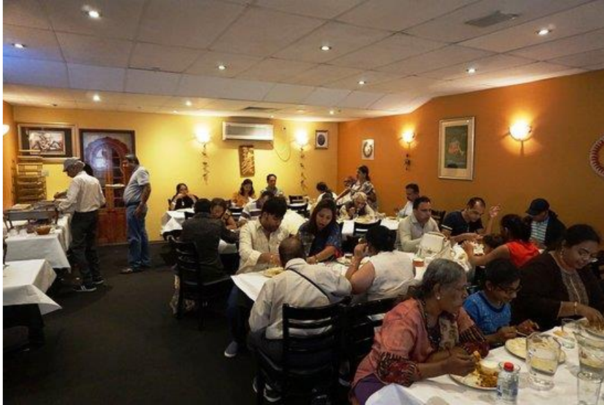
Vrindavan Indian Restaurant