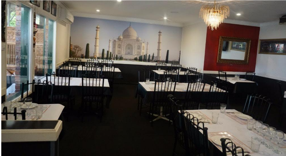
Tandoor & Curry Hut Venue capacity 60