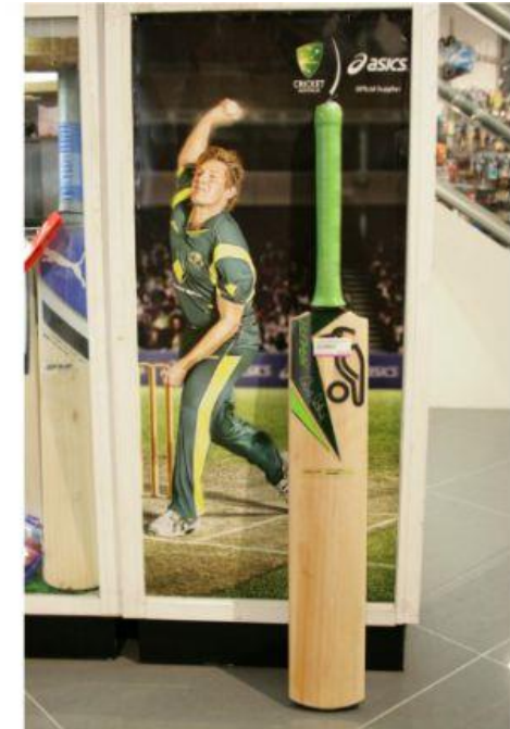
Kookaburra cricket bats