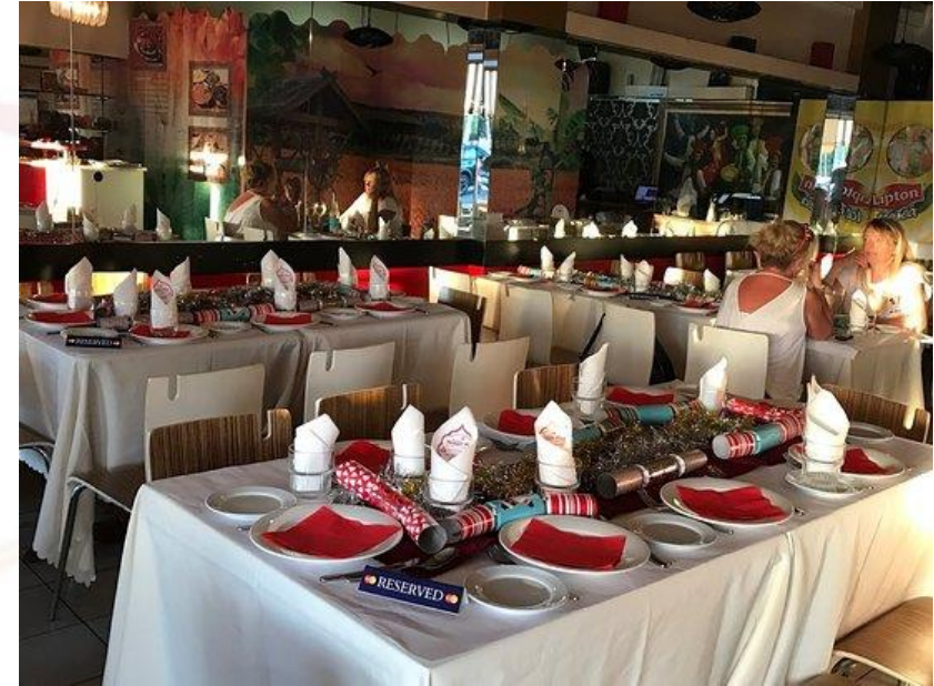
Tandoori Place Venue capacity 140