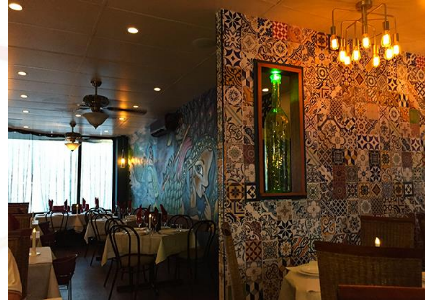
Indian Empire Venue capacity 100