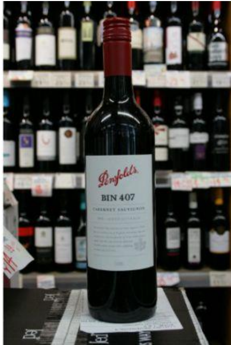
Penfolds Grange Wine