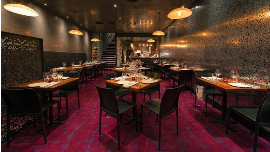
Akki's Indian Restaurant 3 Venues capacity of 70, 55, 40 respectively