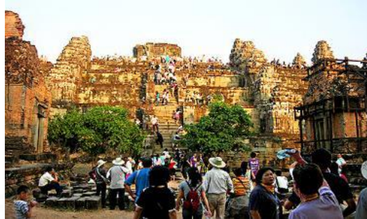
Phnom Bakheng temple