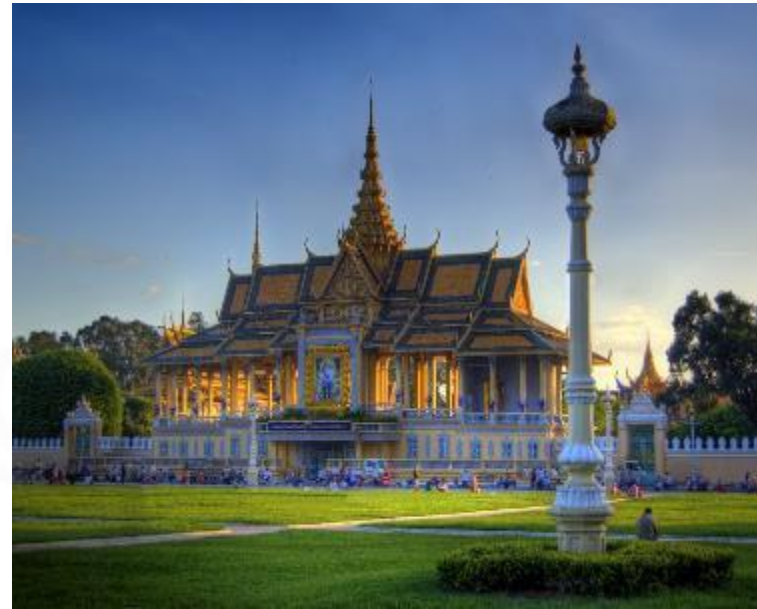
The Royal Palace