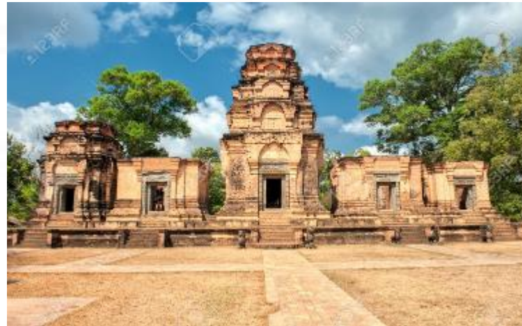
Prasat Kravan temple