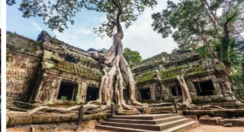
Ta Prohm temple