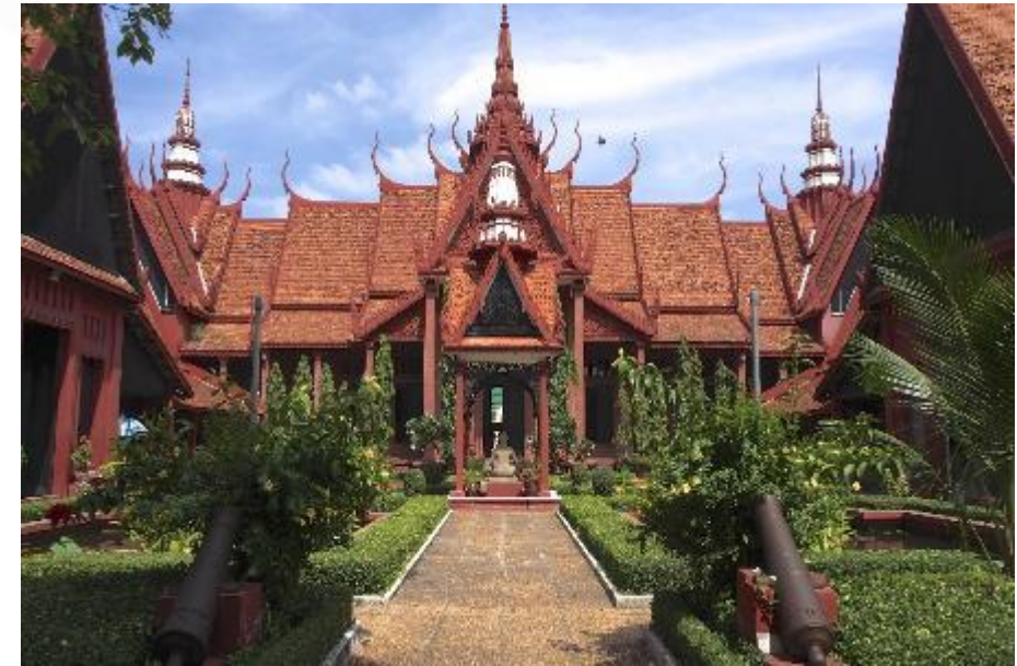
National Museum of Khmer Art