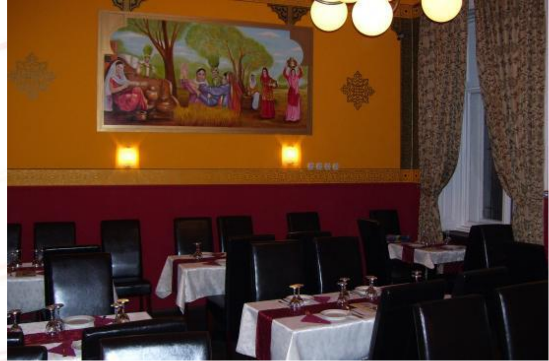
Haveli Indian Restaurant Maximum capacity- 50