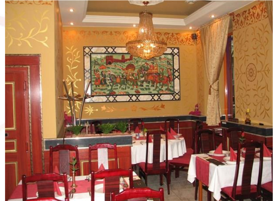
Delhi Darbar by Mr Masala Maximum capacity- 50