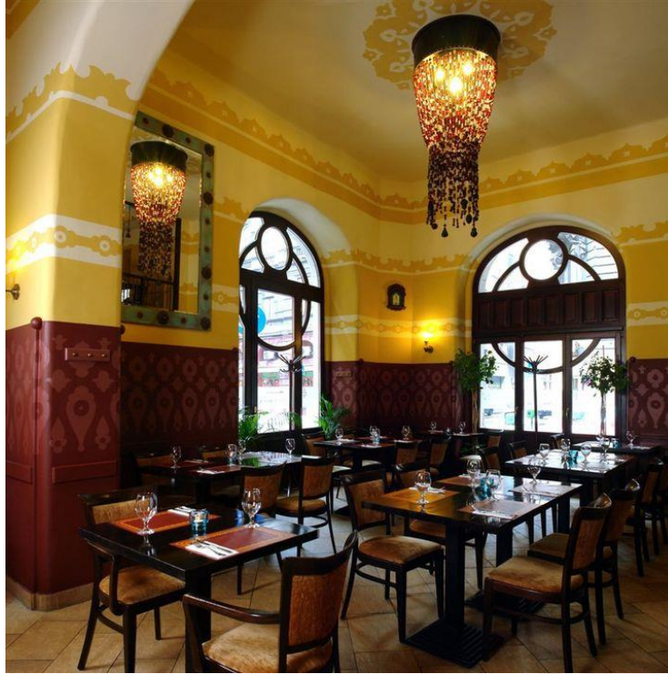
Indigo Indian Restaurant Maximum capacity- 30