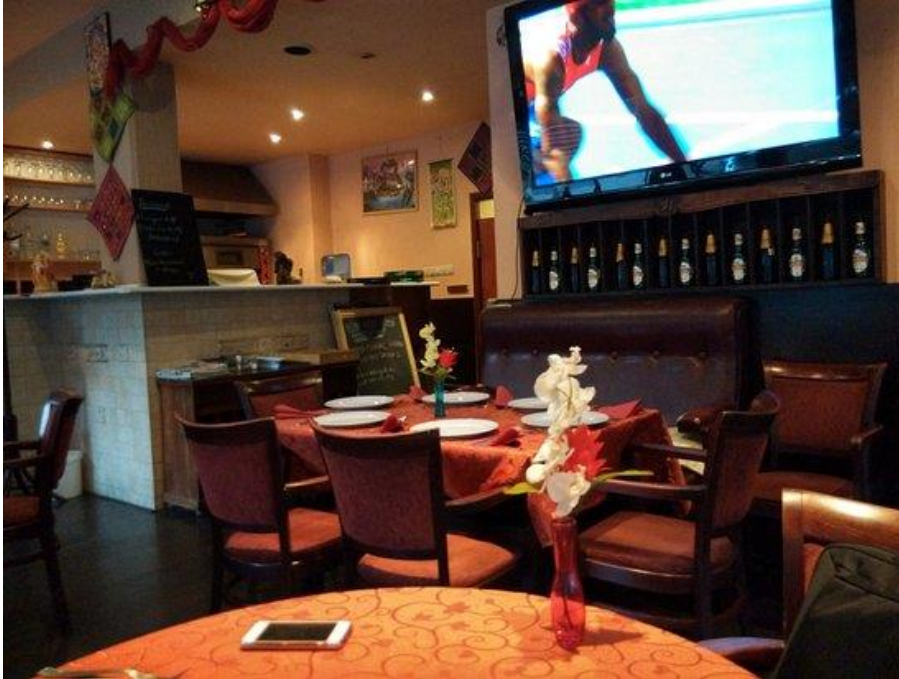
India Gate Maximum capacity- 100