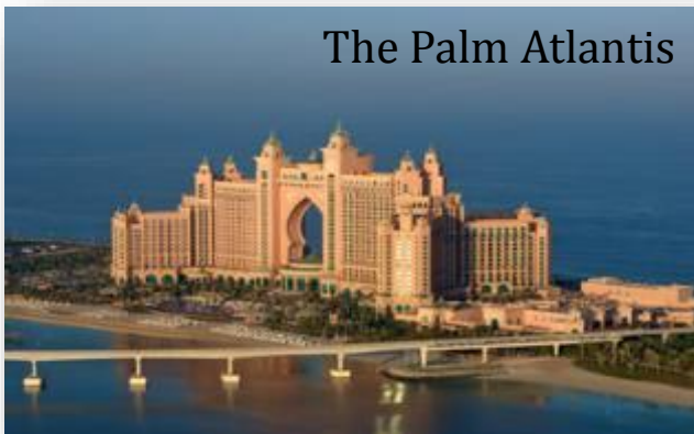
The Palm Atlantis