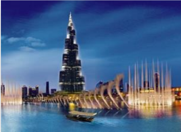
Burj Khalifa & Dubai Fountain