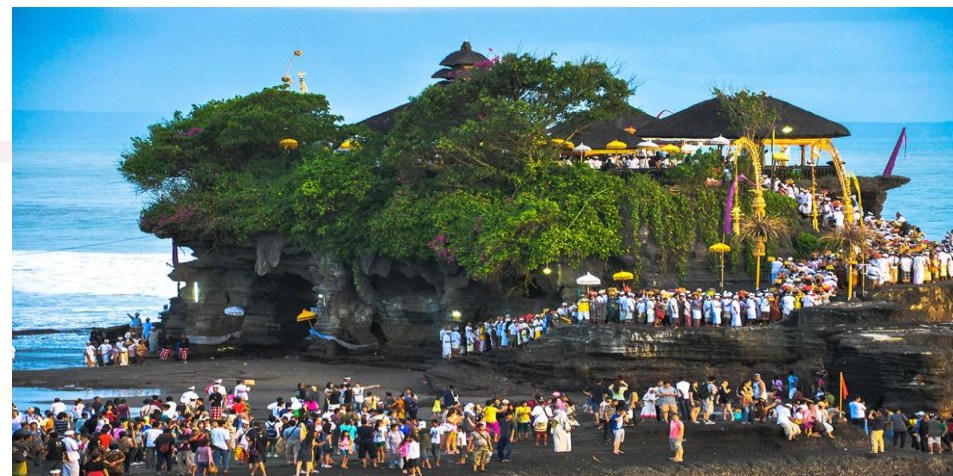
Tanah Lot Temple