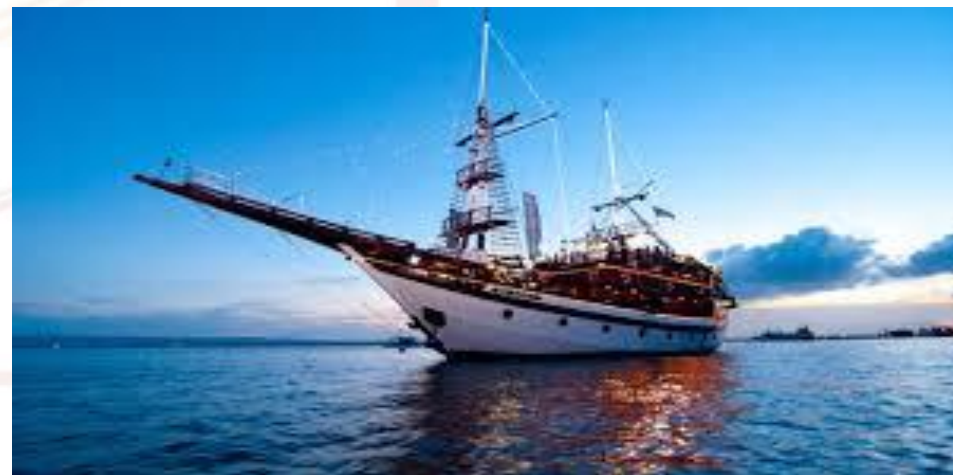
Pirate Dinner Cruise