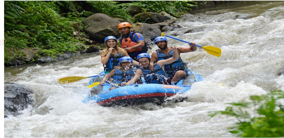
White Water Rafting Ubud