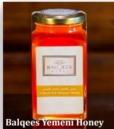
Balqees Yemeni Honey