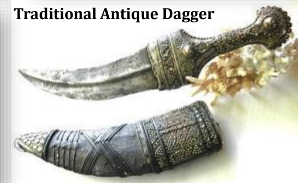
Traditional Antique Dagger