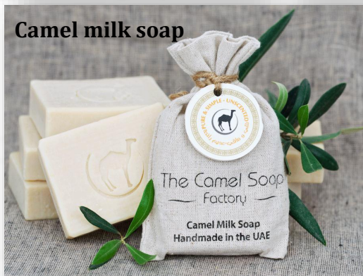
Camel milk soap