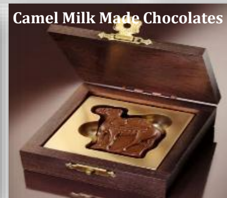
Camel Milk Made Chocolates