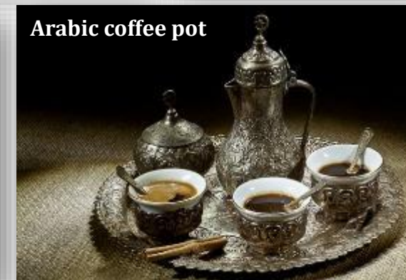
Arabic coffee pot