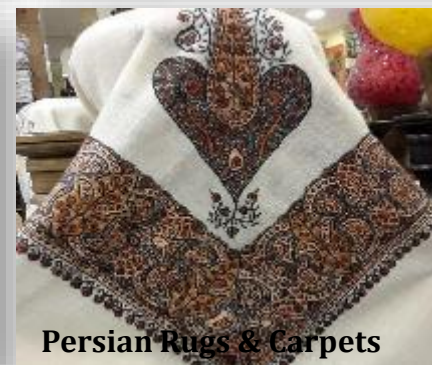
Persian Rugs & Carpets