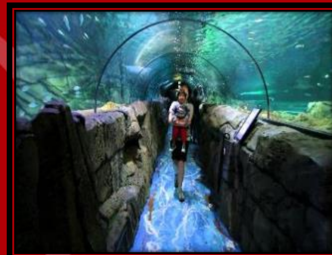
Sea life Aquarium