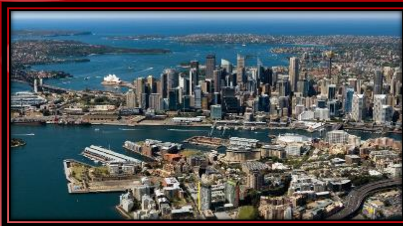
Sydney City Tour