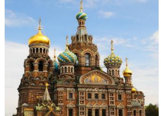
SAVIOUR ON THE SPILLED BLOOD

Alexander II was among the greatest Russian tsars, one of the main accomplishments of whom was the emancipation of serfs in 1861, which brought an end to the de facto slavery of the Russian peasantry, five years before the emancipation of slaves in the US.