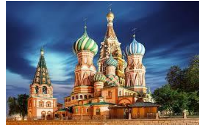
ST. BASIL'S CATHEDRAL

You definitely must visit both its interior and exterior as its architectural style is unique. It was declared in 1990 a World Heritage Site by UNESCO , along with the entire Kremlin.