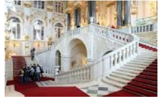
THE WINTER PALACE

From the 1760s onwards the Winter Palace was the main residence of the Russian Tsars. Magnificently located on the bank of the Neva River, this Baroque-style palace is perhaps St. Petersburg's most impressive attraction. Many visitors also know it as the main building of the Hermitage Museum..