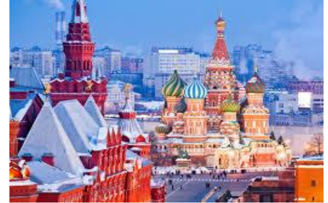
THE RED SQUARE

Red Square is the largest and most famous square in Russia. It has a magnetic pull for all visitors to Moscow. Standing in Red Square, you can see the most significant buildings in the capital: the Kremlin, GUM department store, the State History Museum, Lenin's Mausoleum and of course, St Basil's Cathedral. The bright domes bloom like an elaborate stone flower planted by the architects of the 16th century.