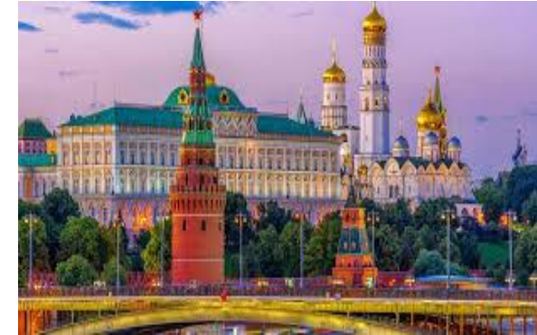
THE MOSCOW KREMLIN

Even those who've never been to Moscow recognize the colorful domes of St. Basil's Cathedral, which sits on Red Square below the ramparts of the Kremlin . The Kremlin's tower-studded, walled complex of domed cathedrals and palaces, which dates to 1156 but occupies a site used for far longer, was the religious center of the Russian Orthodox Church and also the residence of the tsars and now home to the President.