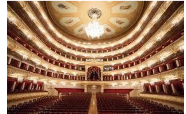
THE BOLSHOI THEATRE

The Bolshoi Theatre is a historic theatre in Moscow, Russia, originally designed by architect Joseph Bove which holds ballet and opera performances. Before the October Revolution it was a part of the Imperial Theatres of the Russian Empire along with Maly Theatre ( Small Theatre ) in Moscow and a few theatres in Saint Petersburg (Hermitage Theatre, Bolshoi (Kamenny) Theatre, later Mariinsky Theatre and others).