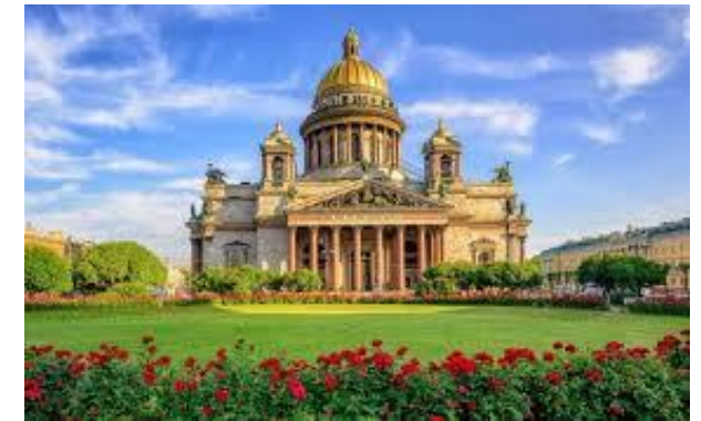
ST. ISAAC’S CATHEDRAL

The golden dome of St Isaac’s Cathedral dominates the St Petersburg skyline. Its obscenely lavish interior is open as a museum, although services are held in the cathedral throughout the year. Many people bypass the museum to climb the 262 steps to the kolonnada (colonnade) around the drum of the dome, providing superb city views. French designer Auguste de Montferrand began designing the cathedral in 1818, despite the fact that he was no architect.