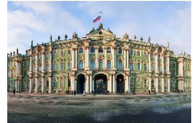
STATE HERMITAGE MUSEUM

The State Hermitage Museum in St Petersburg , Russia, is the second largest museum in the world and is home to over 3 million pieces of art from all over the world. Set over 6 sprawling buildings running along the Palace Embankment next to the Neva River, it was founded in 1764 when Catherine the Great acquired a huge collection of art from a German merchant, and has been open to the public since 1852.