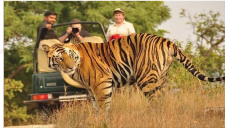
Jeep Safari at Corbett County Resort