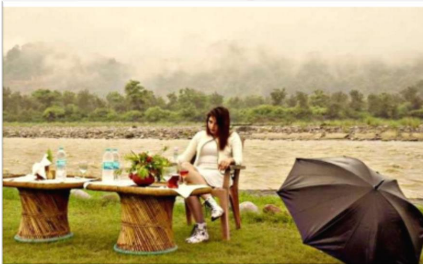
Wild Life Experience at Tiger Resort