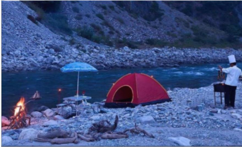
Adventure Stay at the Solluna Resort