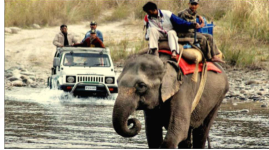
Elephant Safari at Aroma Heavens Corbett