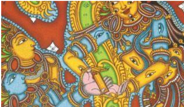
Mural Painting of Kerala