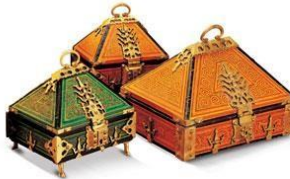
Netturpetti – the traditional jewel box of Kerala