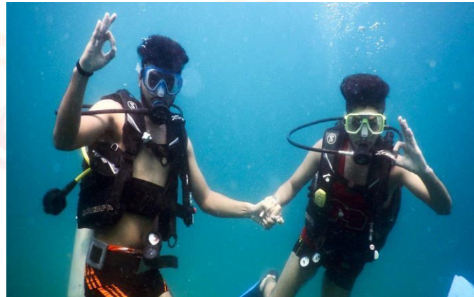
Scuba Diving – INR 6000