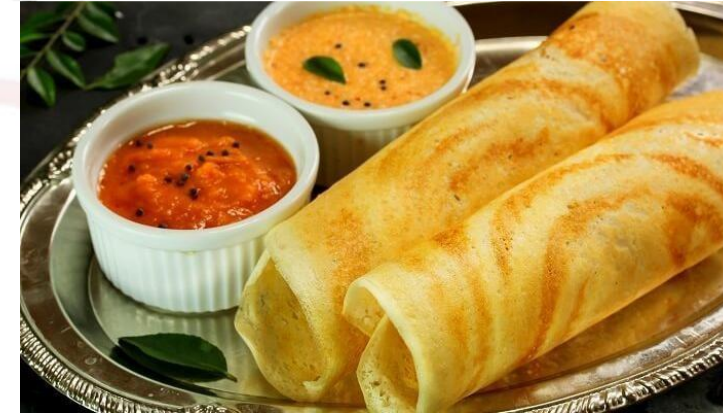
Dosa Ghee Roast With Kerala Style Sambar