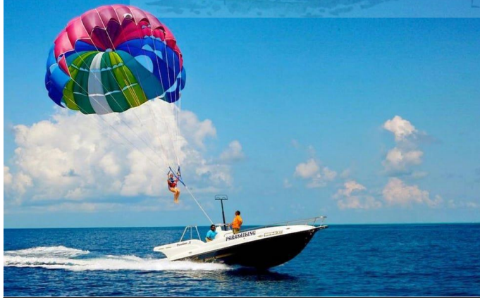
Parasailing – INR 1600