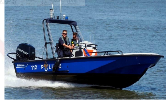
Speed Boat Safari – INR 1600