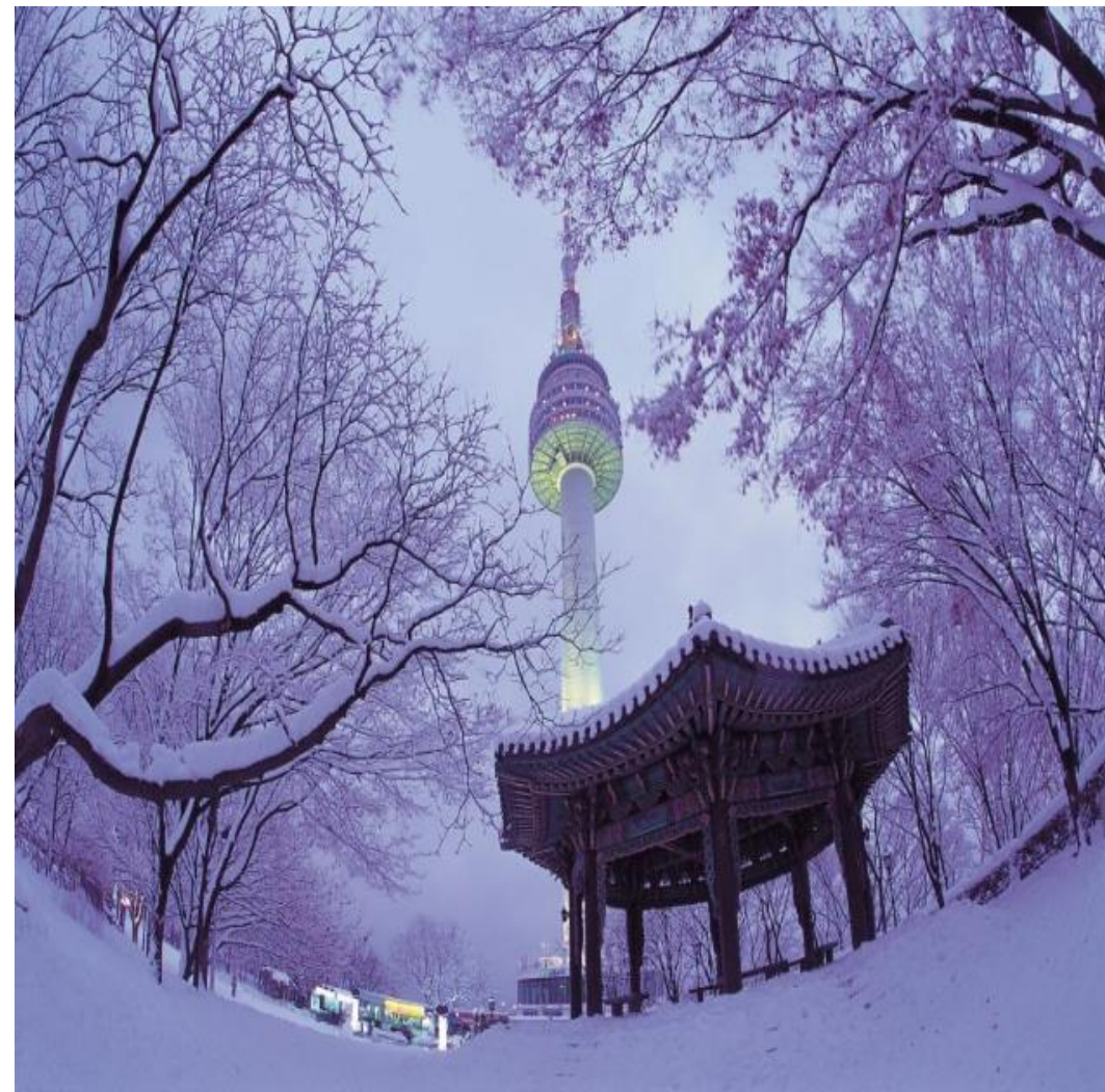
N Seoul Tower