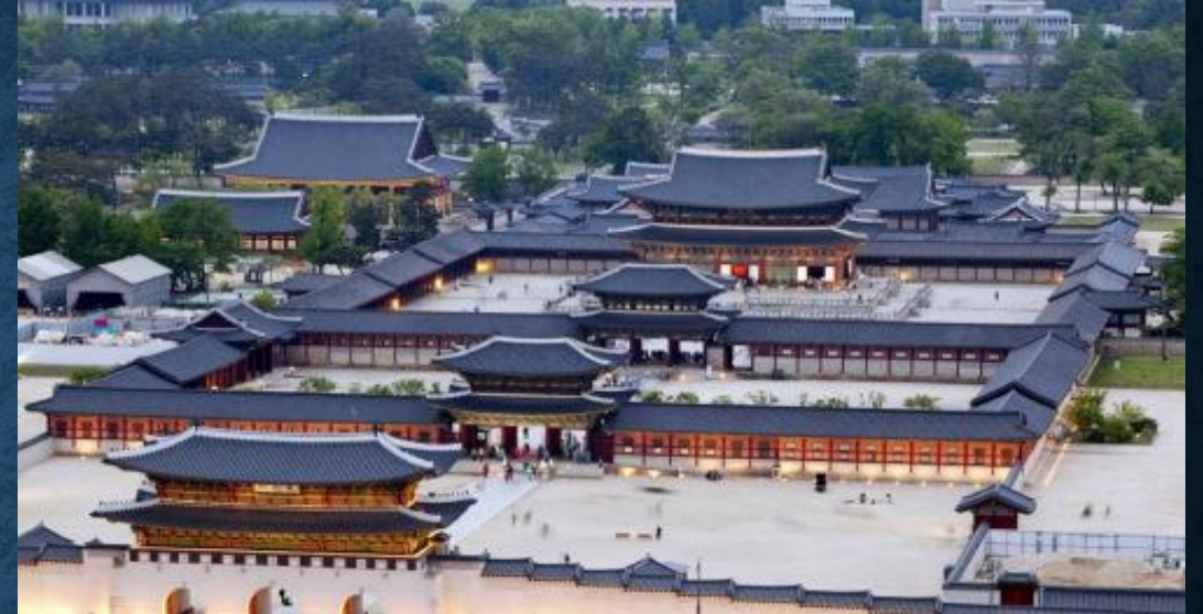
Korean Folk Village