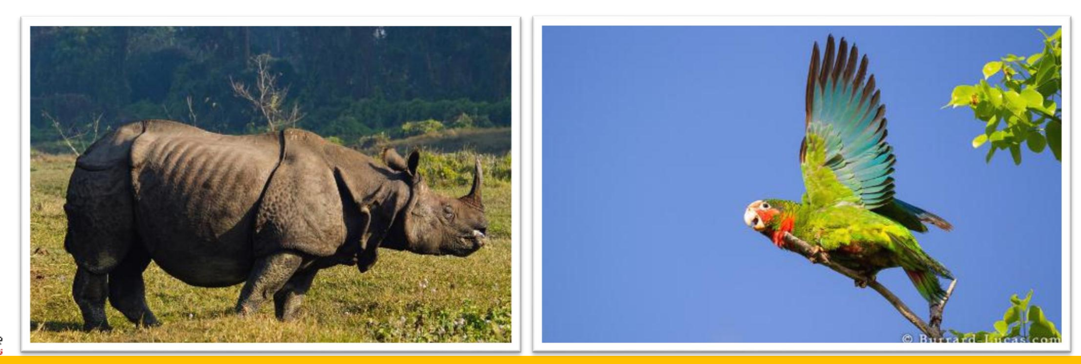
www.tripnavigator.in – Pioneers in Corporate Travel & Events